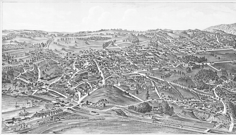
BEACON ON THE HUDSON, U. S. A. 1886