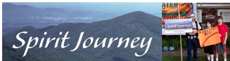
Appalachian Trail walk for the homeless, and for the environment.